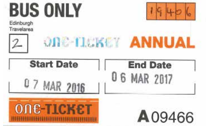
Photo ID Example: